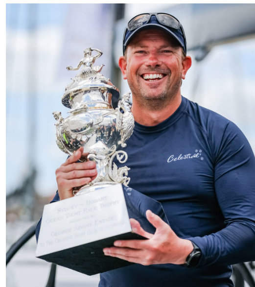
Not often a BYC member wins the Sydney to Hobart Yacht Race

Well, my first year at the helm as Vice Commodore. Let's say I have been educated, overwhelmed with support and proud to be in this position.