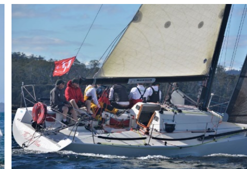
The Dog House