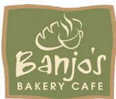
Banjos Bakery Shoreline

The Bellerive Yacht Club appreciates the support of all our partners and particularly thank the following: