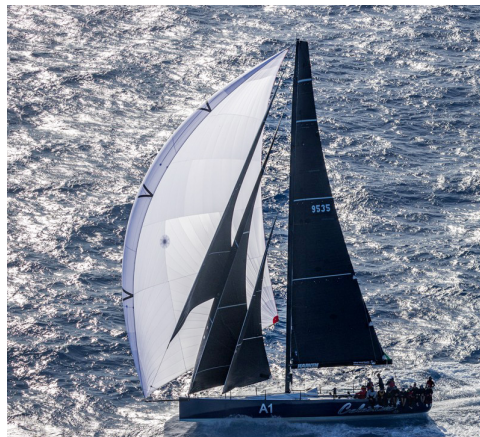
Celestial, winner of the Sydney to Hobart Yacht Race 2022